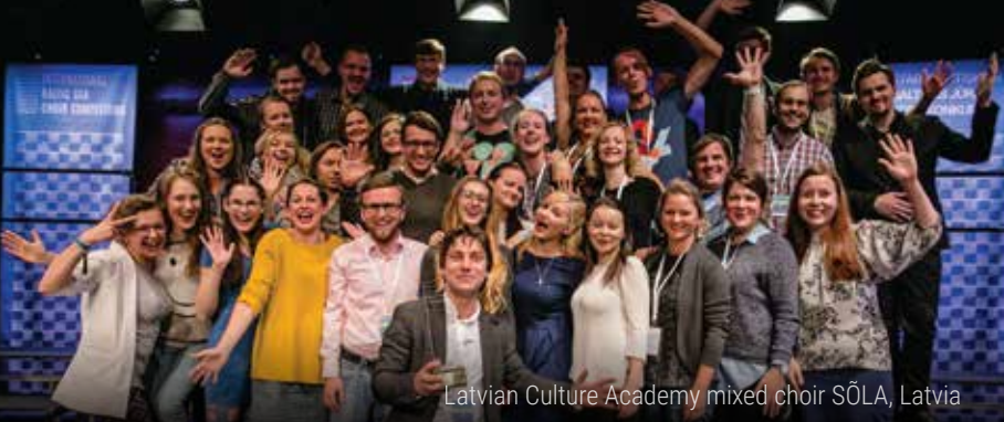
Latvian Culture Academy mixed choir SÕLA, Latvia