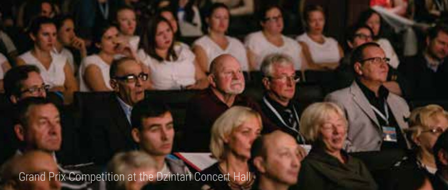
Grand Prix Competition at the Dzintars Concert Hall