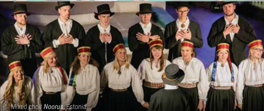
Mixed choir Noorus , Estonia