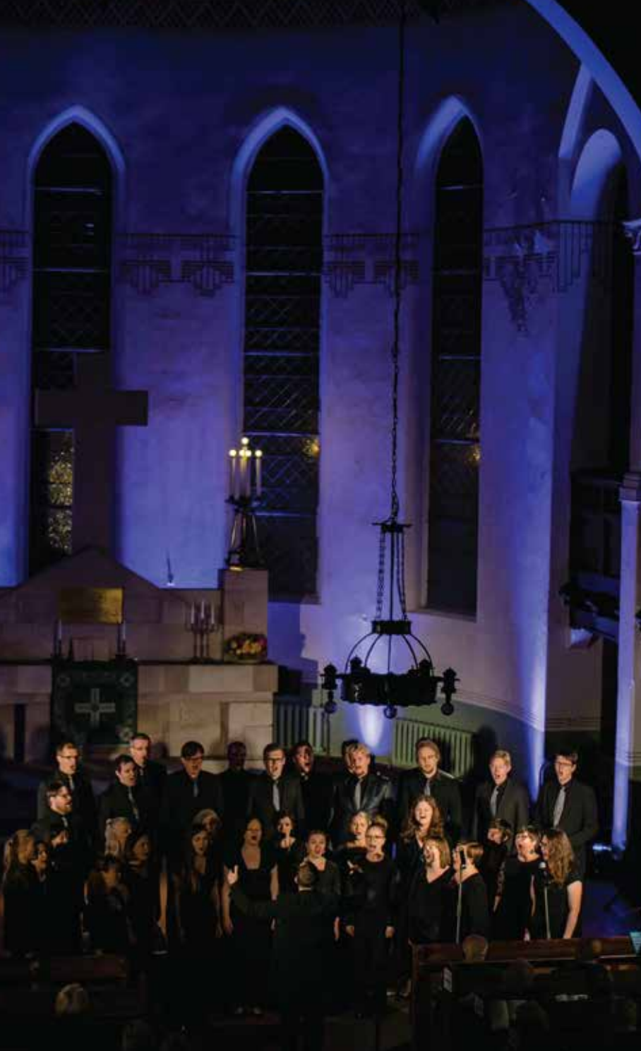
Chamber choir Audite , Finland Opening Concert at Dubulti Church