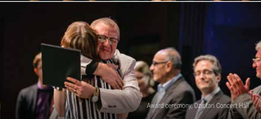
Award ceremony, Dzintari Concert Hall