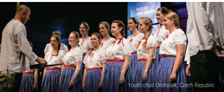
Youth choir Ondrašek , Czech Republic

For the best conductor - monetary award 500 EUR