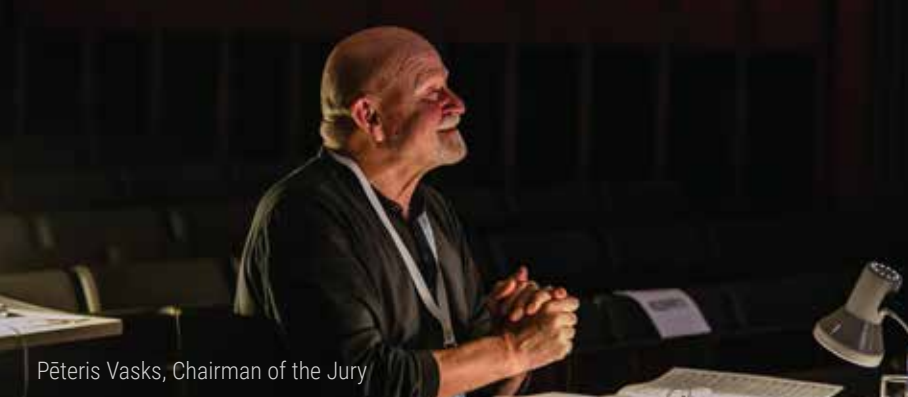
Pēteris Vasks, Chairman of the Jury