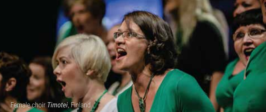
Female choir Timotei , Finland