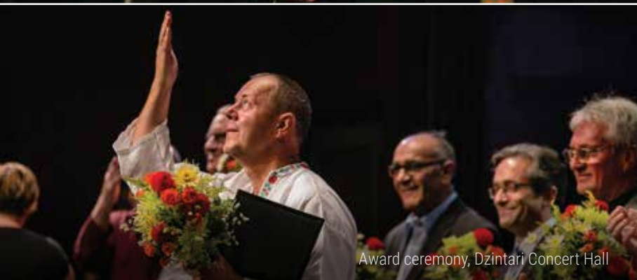
Award ceremony, Dzintari Concert Hall