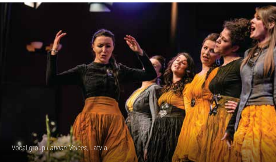
Vocal group Latvian Voices , Latvia