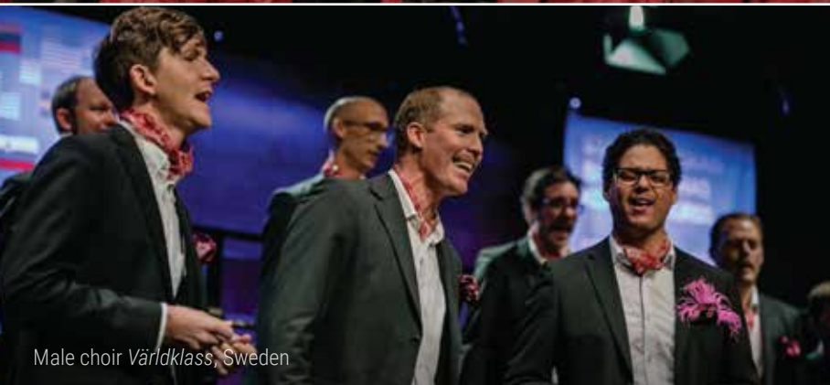
Male choir Världklass , Sweden