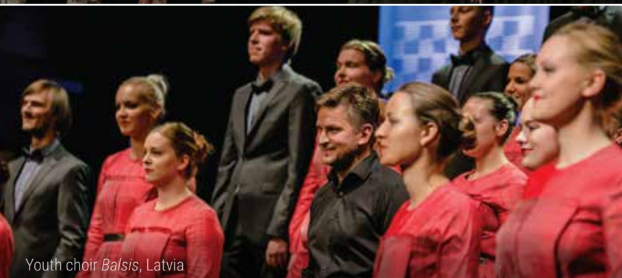
Youth choir Balsis , Latvia