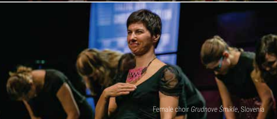
Female choir Grudnove Šmikle , Slovenia