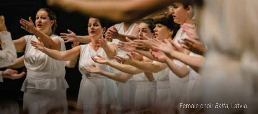
Female choir Balta , Latvia